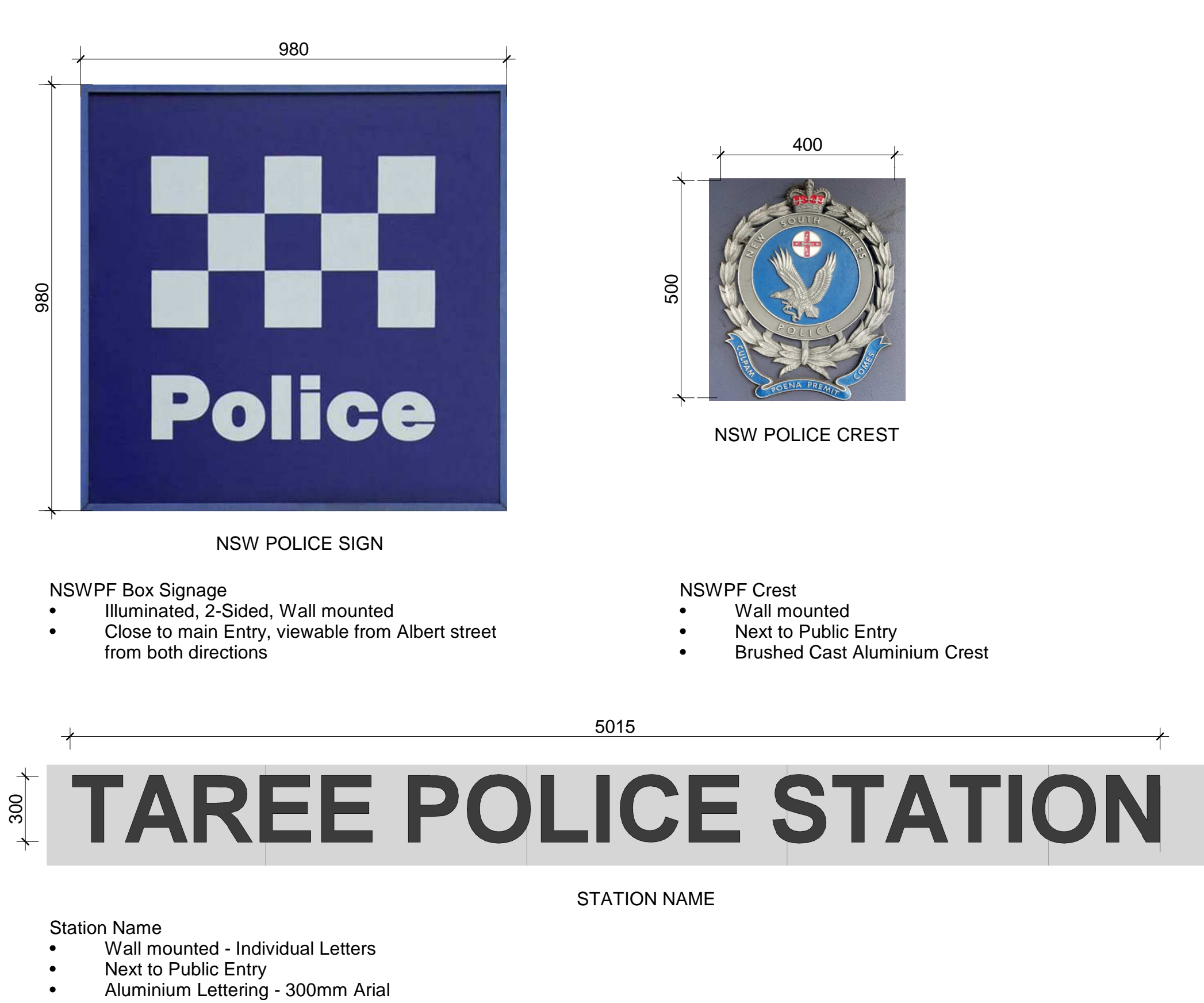
3 POLICE SIGNAGE DETAILS

General Notes This drawing is the copyright of Group GSA Pty Ltd and may not be altered, reproduced or transmitted in any form or by any means in part or in whole without the written permission of Group GSA Drawings to be printed in colour. Do not scale drawings. Dimensions govern. All dimensions are in millimetres unless noted otherwise. All dimensions shall be verified on site before proceeding Any areas indicated on this sheet are approximate and indicative only.